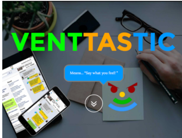
* Interactive news chat application for iPhone & iPad

desires and circumstances. Thus to be a consistent solution you must be shapeless, formless, like water my friend :)