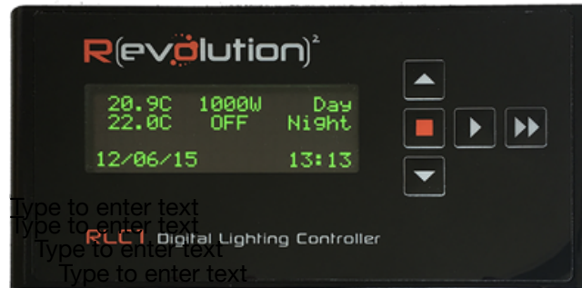
* Original text base controller interface

web site. Need assistance building tangible solutions you can touch, let's discuss the details, I'm happy to assist.