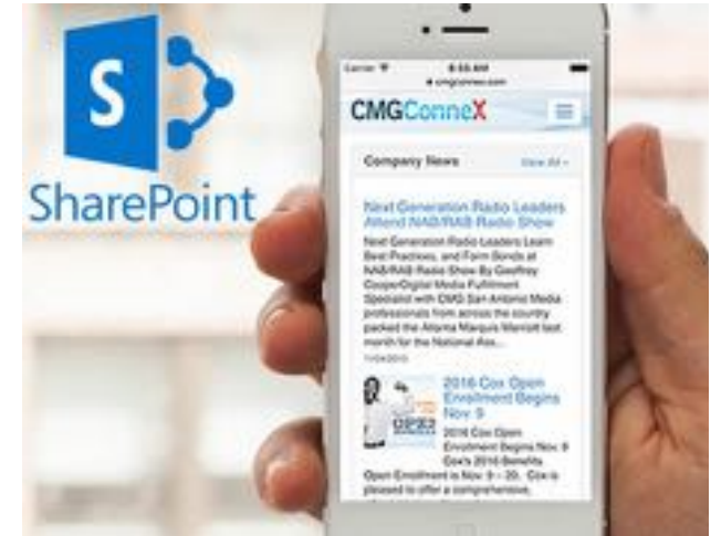
* Enterprise Sharepoint turned mobile responsive

This includes data driven business applications, media applications, message based applications like twitter and more. Because I'm not exclusively a mobile developer, I'm able to offer expert integration with other backend services, or proprietary in-house systems that you may possess; allowing your users to benefit from every aspect of your existing or new backend solutions, but using mobile devices.