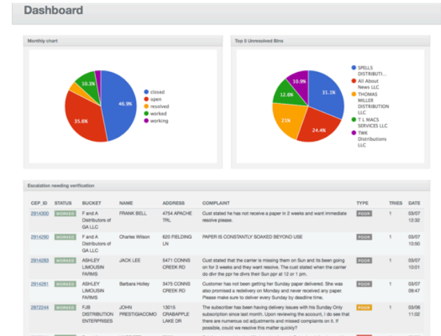
* Dashboard of automated system for managing customer issues and their resolution